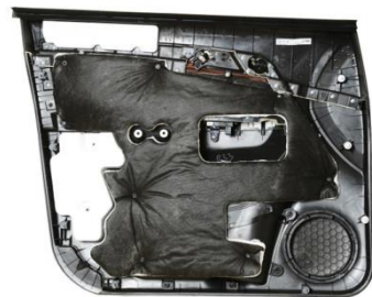
car noise suction

Cosmonate CG-29N is Special Modified MDI which is widely used in, such as a healthy pillow, sound-absorbing material for automobile, Head Rest and furniture Mold foam, of which permeability and fluidity and formation are so high enough to complicated Mold formation.